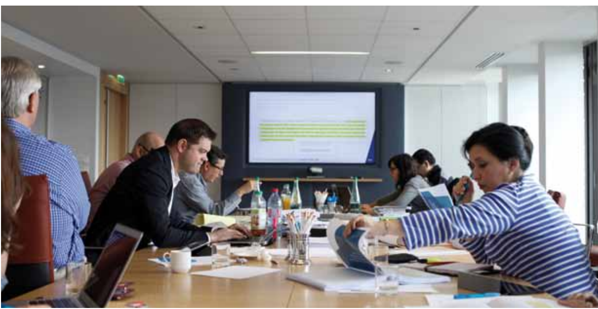
Sunday, April 6, 2014, offices of Dechert LLP in Paris. Preparatory meeting for the hearing on annulment of the OXY case. Process of performing a full review of Ecuador's opening submission for the annulment hearing.

In sum, the best evidence that Claimants are only entitled to a maximum of 60% of the FMV of Block 15 is that they promised to pass along 40% of any recovery to Andes. That proves that they knew that their own share of damages was limited to the value of the non-transferred part of the investment. Claimants knew or should have known that they could not base their claim on Andes' loss because of the lack of jurisdiction of this Tribunal."156