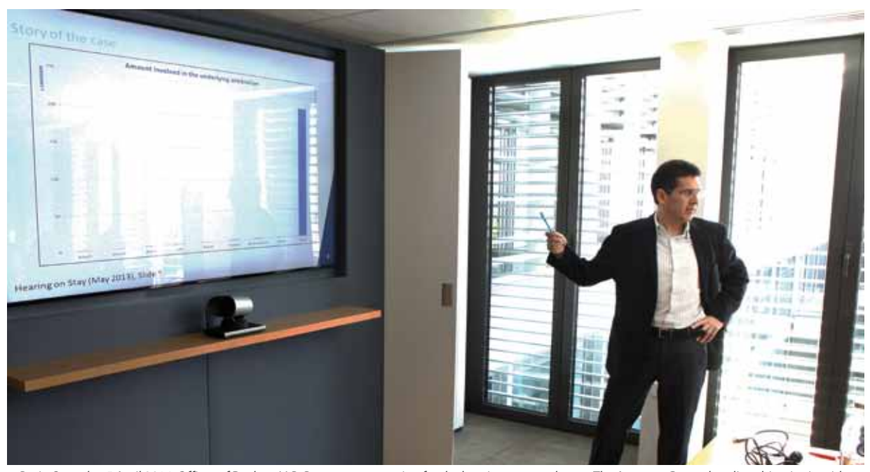
Paris, Saturday 5 April 2014, Offices of Dechert LLP. Preparatory meeting for the hearing on annulment. The Attorney General outlines his criteria with respect to the presentation of the procedural history of the case.