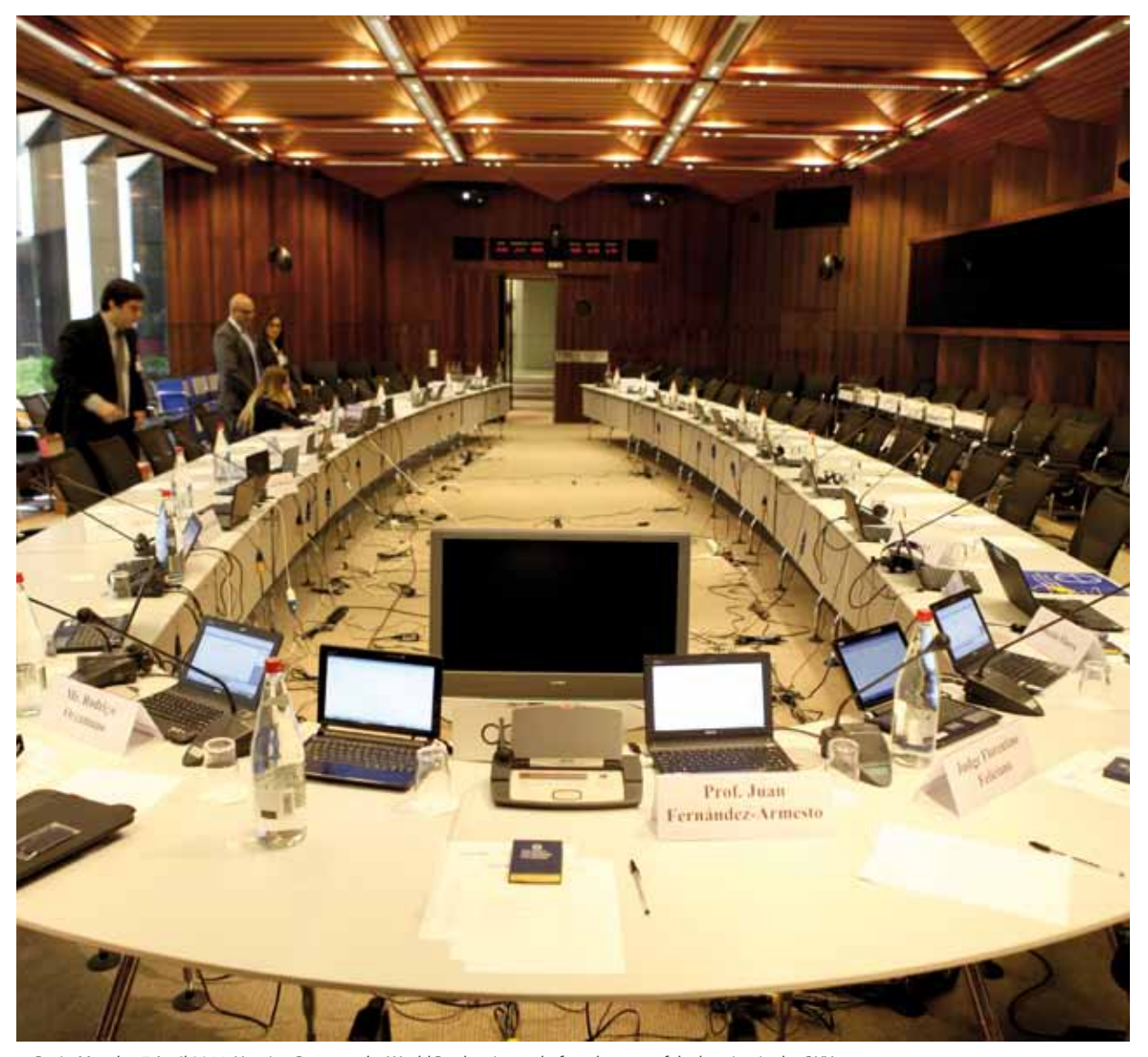
Paris, Monday 7 April 2014, Hearing Room at the World Bank, minutes before the start of the hearing in the OXY case.

94. Furthermore, the Tribunal accepts, albeit without prejudging the merits of the case, that attempts at reaching a negotiated solution were indeed futile in the circumstances." (Emphasis added).