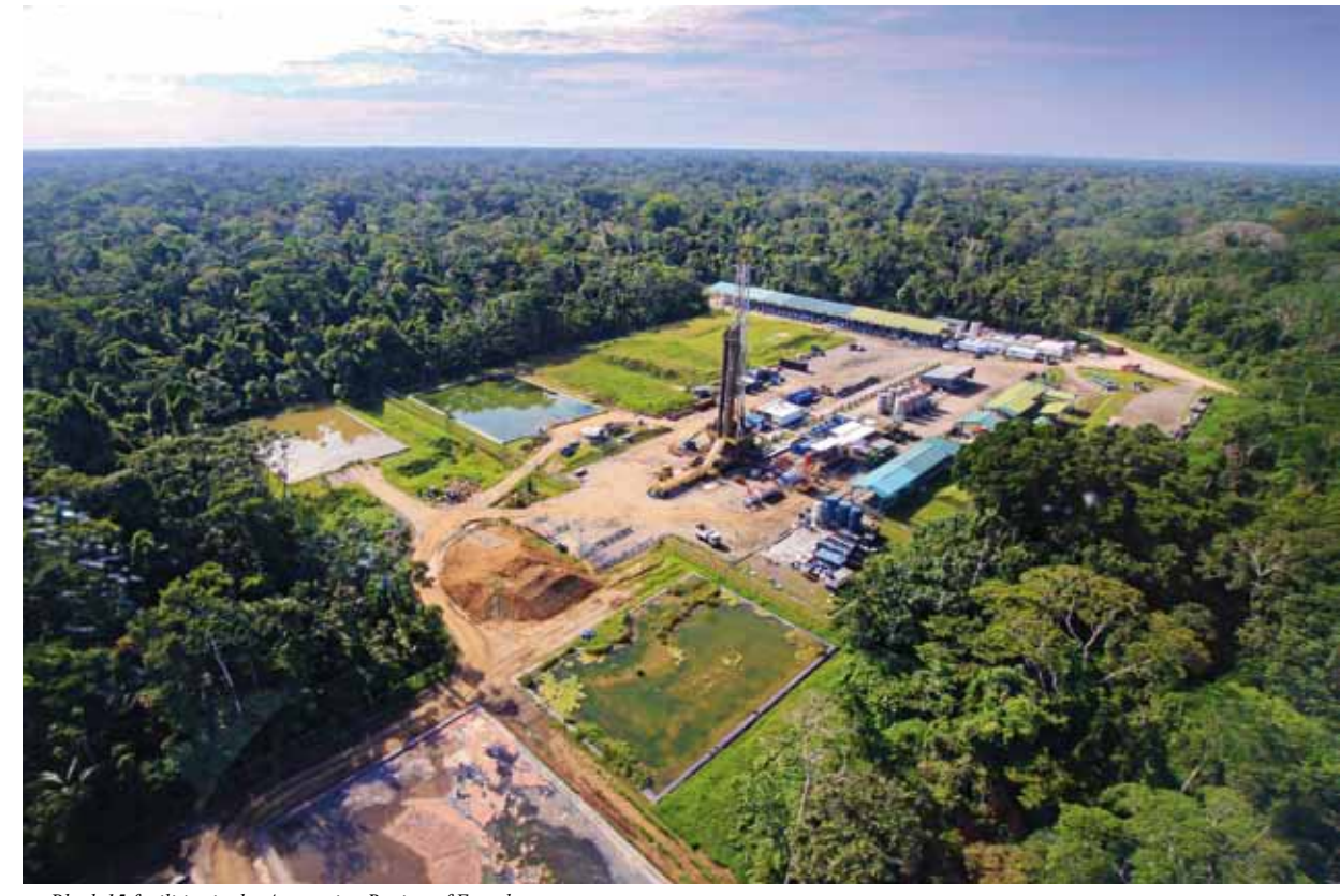
Block 15 facilities in the Amazonian Region of Ecuador

The contract expressly stipulated that OXY was not authorized to transfer or assign its rights and obligations under the Participation Contract to a third party, without the prior authorization of the then Ministry of Energy and Mines. Similarly, OXY was not authorized to participate in or create a consortium that involved the Participation Contract without the prior authorization of the State. Failure to obtain such authorization constituted grounds for Termination of the Participation Contract through Caducidad, which was also contemplated by the Hydrocarbons Law.